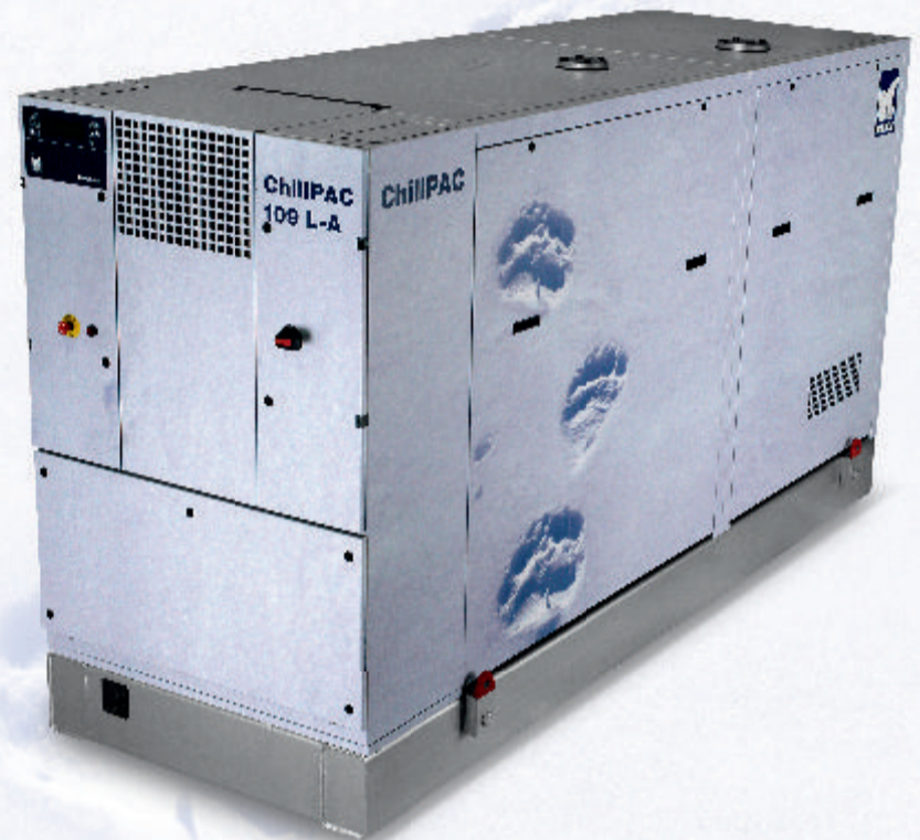
ChillPAC featuring SABCube variable-speed screw compressor